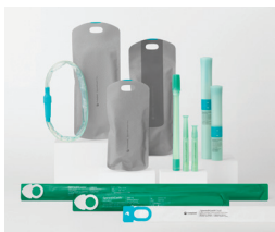
Product Samples* and Tools