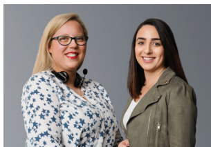
Coloplast Care Advisor Individualized follow-up by phone