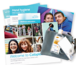
Clinician-validated Product and Lifestyle Education

Coloplast Care guides your patients from confusion to confidence