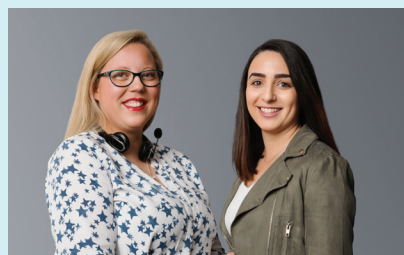
Coloplast Care Advisor