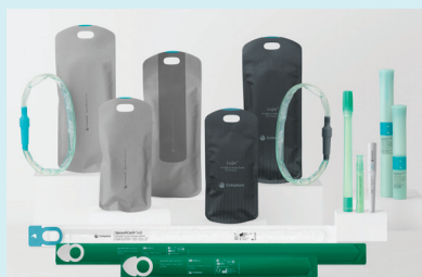
Product access and guidance*